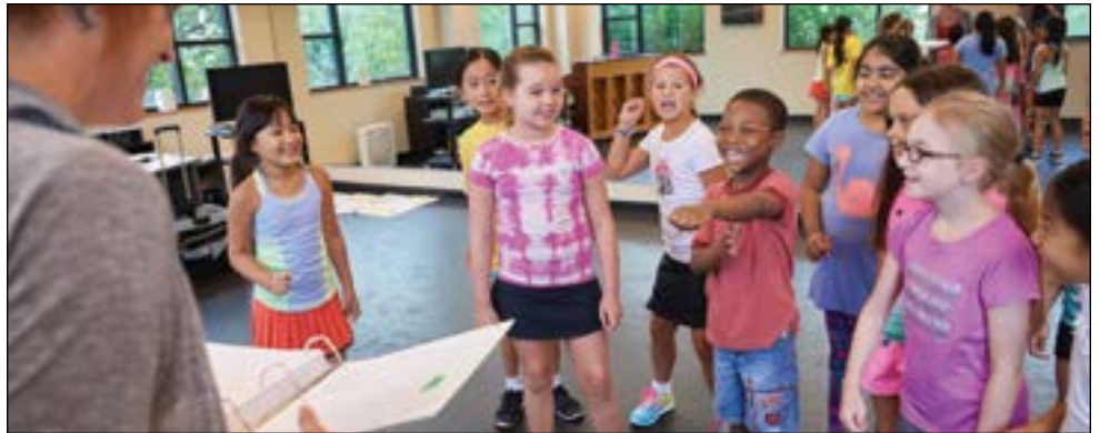
Students in the STAGES Academy premiere groundbreaking works and the classics.

For updates about the Civic, please follow them on social media (Facebook and Twitter). Tickets, newsletter sign up and additional information is available at stlco.org .