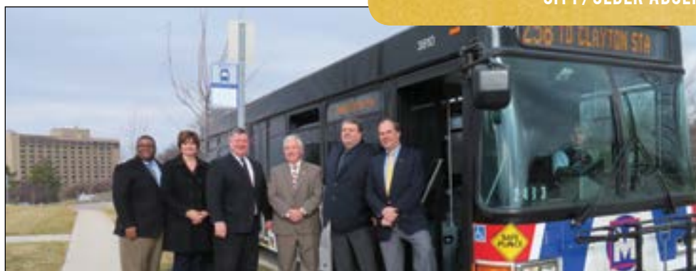
City of Chesterfield, St. Louis County and Metro representatives unveil new MetroBus stops.

To register for the OASIS programs, call 314.862.4859 x24 or visit oasisnet.org/STL for more information.