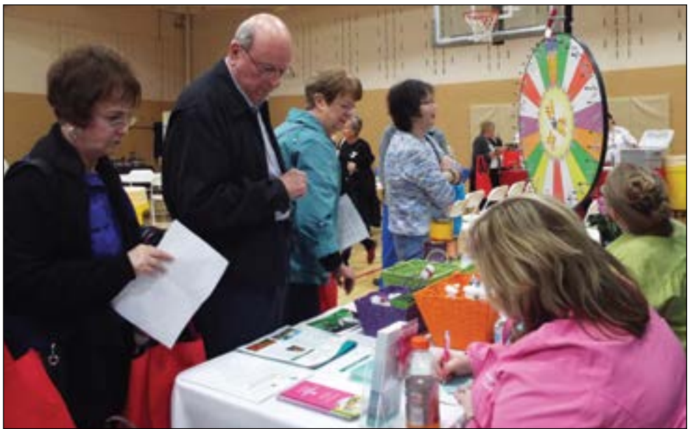
The Sampler has over 40 vendors specializing in health, wellness and services for older adults.

The Chesterfield Older Adult Task Force, in partnership with the West County Family YMCA, is hosting the 4th Annual Senior Sampler on Friday, April 7 from 10 a.m. to 1 p.m. at the West County Family YMCA, located at 16464 Burkhardt Place in Chesterfield. This free event is for persons 50+ who will be offered sample products, product and services information, demonstrations and health screenings. Free shuttle services provided by Delmar Gardens will be available from Central Park. For more information about this event, call 636.537.4000.