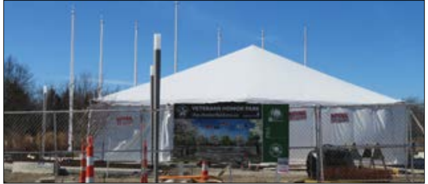
The flagpoles and star monument currently under construction at the park.