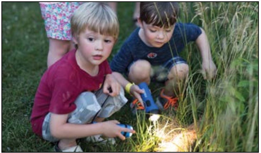
Fireflies are among the many species that are bioluminescent, meaning that they can produce their own light.

Celebrate the important animals that help make the gardens grow! Each week, a different pollinator will be highlighted through fun facts, crafts, games, and other family friendly activities. Come and learn