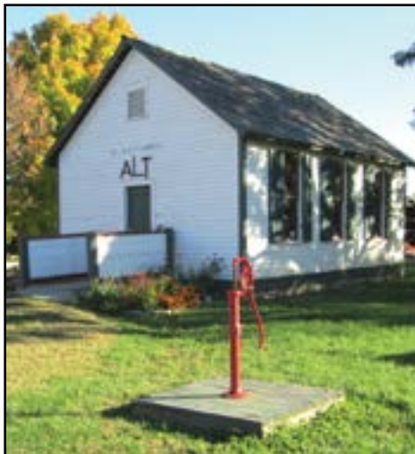
Faust Schoolhouse with pump.

his role in forming Missouri into what it is today. The house is partially furnished. Also on the site are the original 1820s and 1860s barns, the smokehouse, ice house, peach orchard and blacksmith shop. The estate also includes the family cemetery, burial site of the governor and his wife, Nancy.