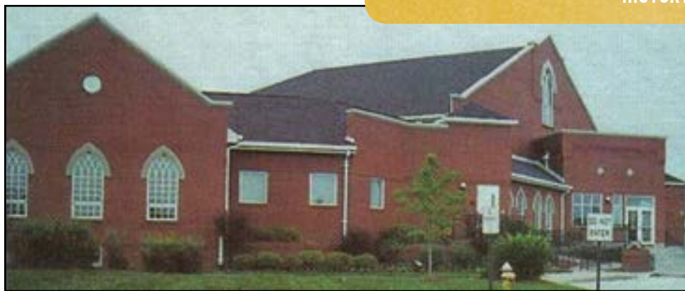
Photo of the First Baptist Church today.