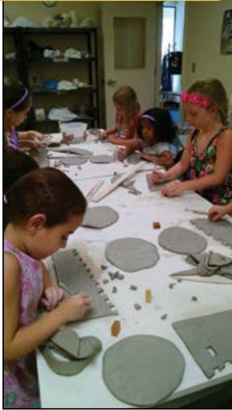
Summer Clay Class at Art Unleashed.