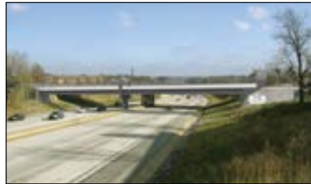
Rendering of Chesterfield Parkway East Pedestrian Bridge.

CHESTERFIELD PARKWAY EAST PEDESTRIAN BRIDGE. In 2015, the City of Chesterfield secured a Transportation Alternatives Program (TAP) grant to fund 50% of the costs to construct a pedestrian bridge over I-64 near Chesterfield Parkway East. This project will provide a safe means of crossing I-64 for both pedestrians and bicyclists. Construction on this project began in the summer of 2016, and will be completed in the spring of 2017.