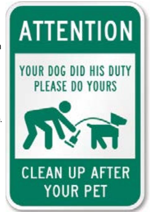
Pet waste bags are available at Eberwein Park.