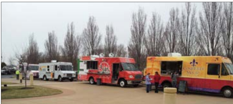
Food trucks are subject to change. Follow the Food Truck Feast events on Facebook for updates.

To register to vote in St. Louis County, you must be 18 years of age by Election Day, a U.S. Citizen and a resident of St. Louis County. You can register to vote at City Hall, most libraries and schools and at motor vehicle registration offices. The Missouri Voter Registration Application is available online at stlouisco.com/elections . Additionally, registration forms can be mailed to you by calling City Hall at 636.537.4000. The deadline to register to vote for this election is March 8.