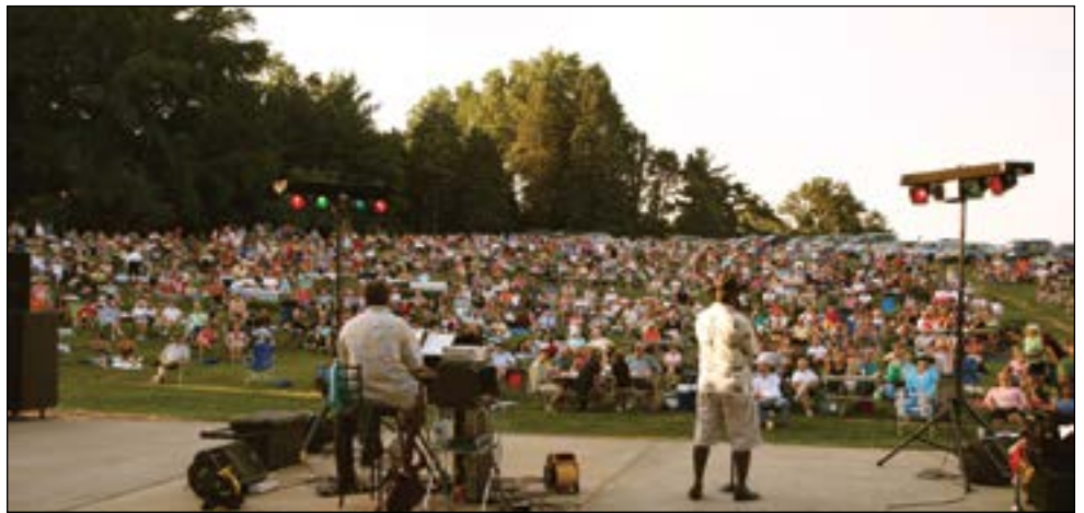
Thousands of spectators come out to the park to enjoy live music and entertainment under the stars at the Chamber's Summer Concert Series.

Come out and golf for a good cause at the 27th Annual Golf Tournament, sponsored by Lindell Bank. Great food, drinks, games and prizes lined up-reserve your spot today! To register, visit chesterfieldmochamber.com .