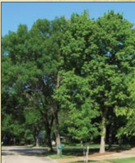
The Emerald Ash Borer kills Ash trees by damaging sapwood and interrupting the tree's ability to transport fluids.