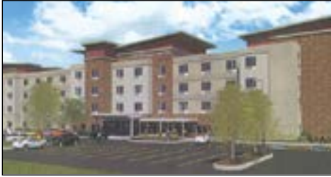
Rendering of TownPlace Suites.