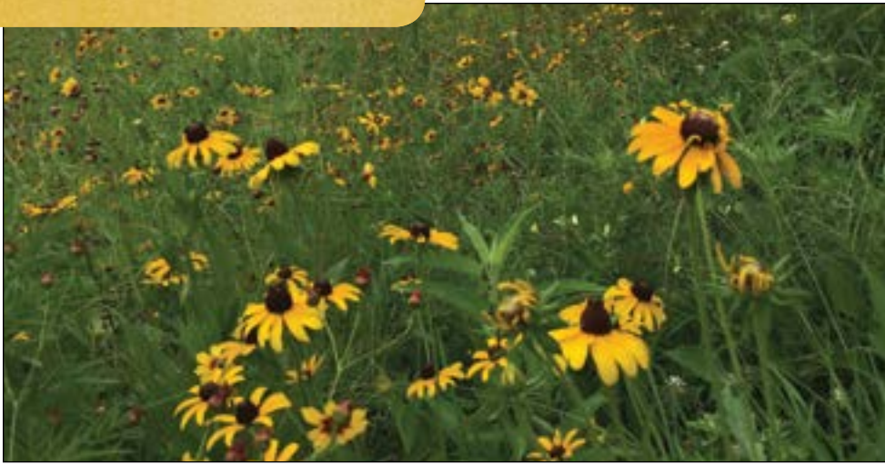
Black-eyed Susans (Rudbeckia Hirta) are native to North America and one of the most popular wildflowers grown.