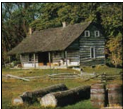
Recreation of the church.