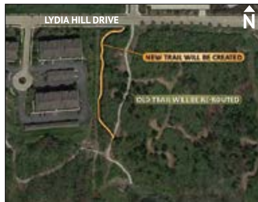
The map above depicts the existing trail and revised the trail route after construction.

A portion of the Riparian Trail and the trailhead entrance from Lydia Hill Drive at Veteran Place Drive is now closed for reconstruction due to the Watermark Apartment project.